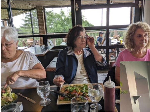
The August, September and October luncheon groups.