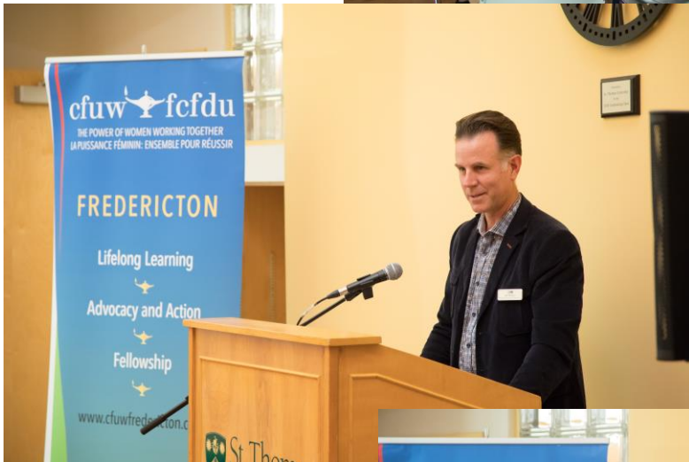
Several award winners, guest speakers, and CFUW Fredericton members attending the Open House.